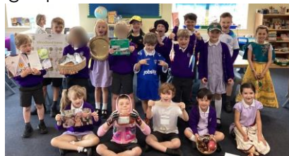
Children from Oak Class

Today we celebrated World Day for Culture and Diversity. The children shared so many wonderful things in their classes and it was very interesting to hear about all the diverse backgrounds and family traditions we have in our school. Thank you to all those children that shared with us today. We were treated to all sort of special things such as photos, traditional clothes, food, books, statues, toys and games. It was great to get a closer glimpse of our Orchard families' lives.